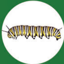
Monarch Butterfly Milkweed