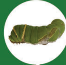
Tiger Swallowtail Butterfly Willow tree