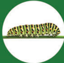
Painted Lady Butterfly White clover