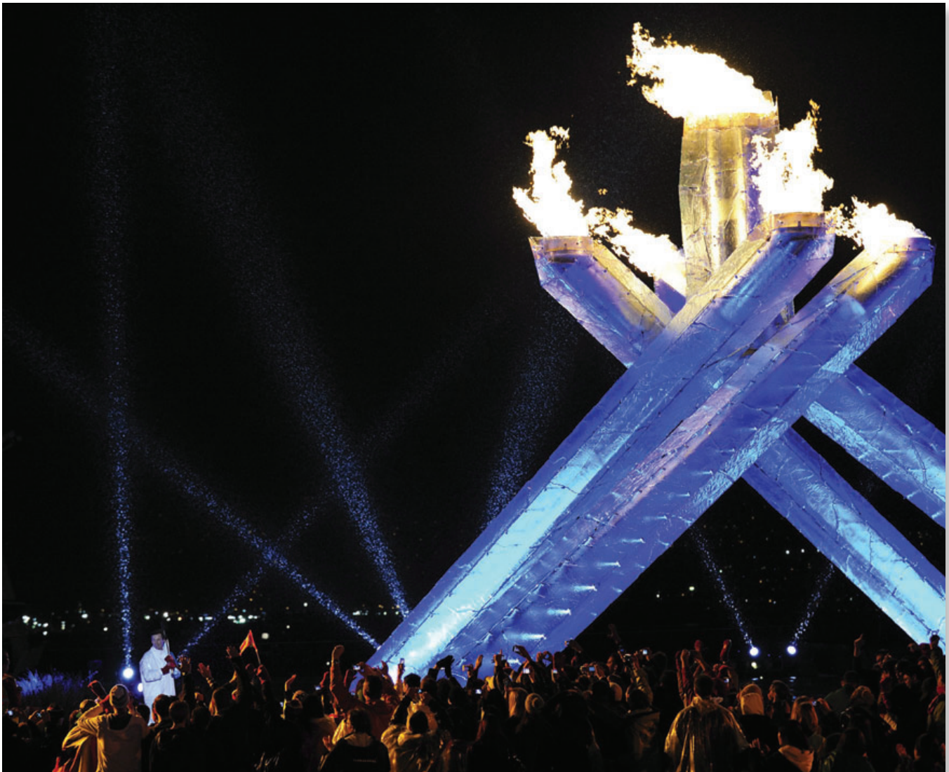
Opening Ceremony, 2010 Winter Olympics

These sample letters present just a few of the thoughts from both sides. In truth, Olympic Committee members have discussed the many points of this issue. It is not a lost cause. One official from the International Olympic Committee said in an interview, “We are doing our best to introduce skateboarding for 2012.” Others say it will likely happen in 2016. So, when will we really see skateboarders, such as U.S. superstar Shaun White, compete at the Summer Olympics? Who knows? For now, the answer is still up in the air.